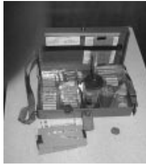
The M272 water test kit

With all the cost and use limitations, it is still recommended for your field unit or ship to have at least two in your stock of CBR defense equipment. Despite the potable water system being a closed system aboard ship, it can become contaminated if it is compromised in any way. Whatever the case, the M272 is still a sound investment and it is a good idea to include it in your Operating Target (OPTAR).