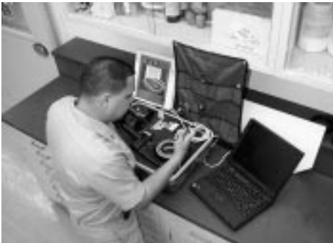
The new Ruggedized Advanced Pathogen Identification Device (RAPID) analyzer provides quick (within 30 minutes) field identification of BW agents.

such as anthrax or Botulinum A toxin. For this reason the NEPMUs have taken on the role of trainers in "Medical Management of Chemical, Biological, Radiological and Environmental (CBRE) Casualties," a three-day course designed for medical personnel. Shorter briefings may be available on request from your cognizant NEPMU.