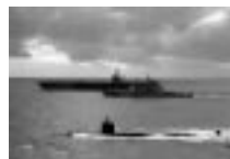
Our mission: Protect the Force

At the end of the movie Saving Private Ryan , Army Captain Miller's (Tom Hanks) dying admonition to Private Ryan is a whispered, "earn it." Working daily at the Pearl Harbor Navy Base I cannot help but be emotionally impacted by the vivid memories of our nation's past and those who faithfully stood the watch before us. When I glance across the harbor at the silent USS Arizona Memorial I can easily imagine a collective chorus rising.....shouting, "earn it".